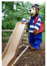
Here are just some of the happenings at the Teddy Bear's Fun Day. Unfortunately we don't have space to show more