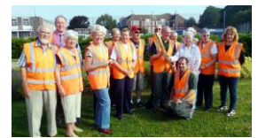
Some of the GWCP stewards

On 5 th July the Olympic torch was due to reach Lowestoft along the A12 and we were requested to provide 17 stewards to line the route from Weston Road to Dene's High School. Large crowds turned up to cheer and there was a wonderful party atmosphere. The Olympic Torch Crew congratulated us on one of their best receptions.