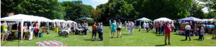
An early afternoon panorama before the crowd arrived

Once again, GWCP's traditional luck held. The only fine day in the entire week was the day that we picked for our celebrations. The School playing field was filled with gazebos, games, stalls and bunting and the Gunton