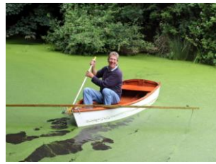
2 nd August

We always thought that the absence of duckweed from the lower pond was too good to be true and, sure enough, it changed from clear water to a thick layer of weed in just a few weeks ... As you know, there's only one thing that men enjoy more than getting muddy and that is, messing about in boats. So we spent several happy days trying all sorts of ideas from nets to leaf blowers until we finally succeeded with an ingenious hinged boom to offload tons of the stuff.