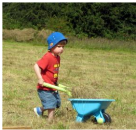
Max at full speed

At the request of Matt Gooch of Suffolk Wildlife Trust we mobilised a 32-strong work party in mid-August to clear the meadow which had received its annual cut the previous day. The weather was very hot and copious supplies of water, followed by mid-morning coffee and cake were required to keep the troops happy. Soon it was lunch time when Rosemary and Carol produced a wonderful selection of rolls, pasties, pies, sponges and chocolate cake.