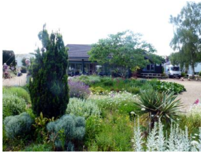
Beth Chatto Gardens

It was 10 years ago when the Group made its first visit to the Beth Chatto Gardens and we looked forward to revisiting this fascinating garden which serves as a great example of what can be grown under drought conditions. All agreed the flowers and foliage looked splendid and it wasn't long before the coach boot was full of new purchases from the plant nursery. For lunch we transferred to the Boathouse Restaurant in nearby Dedham, perfectly located on the banks of the River Stour. Unfortunately our large party rather overloaded the catering staff and there was some delay, but the lunch was worth waiting for. In the afternoon a few visited the Sir Alfred Munning Art museum while