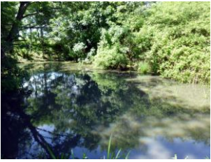
20 th June