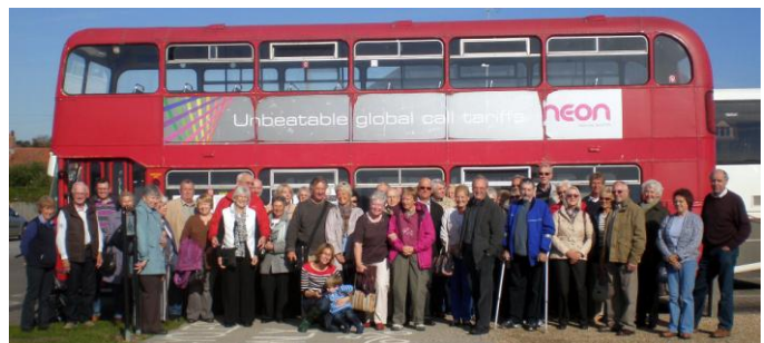
The Red Bus, a blue sky and GWCP at Aldeburgh