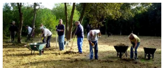
The Rakes' (slow) Progress

Late Summer rains and equipment breakdowns caused havoc with our usual grass cutting activities on the wild flower meadow. Eventually, the Council were able to cut it with a rotary mower but soon the meadow was covered with a heavy mulch which was almost impossible to rake off. However our stalwart band of volunteers were not to be beaten and perseverance finally paid off..