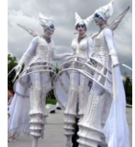
A Floriade group

Because of cancellations due to health reasons there may be a few places available on next year's trip to Switzerland 3 rd - 9th June. Call David on 01502-515944 if you are interested.